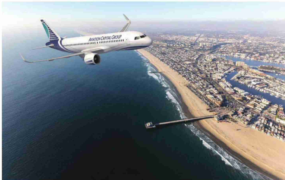
Liftoff: former PacLife unit Aviation Capital makes debut on list