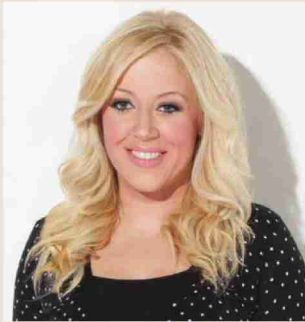
LYNSI SNYDER President In-N-Out Burger Inc.