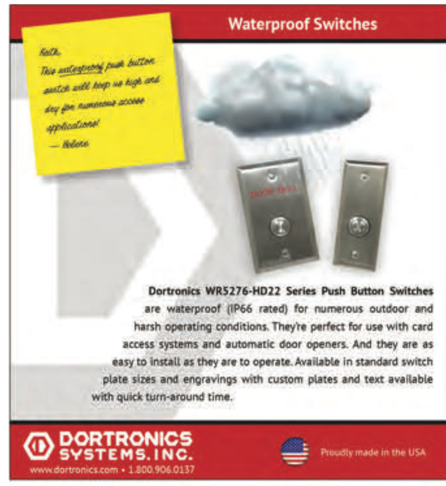
For product info #S24 securitymgmt.hotims.com

HEATHER MARTIN IS AN EDITOR WITH HIKVISION USA.